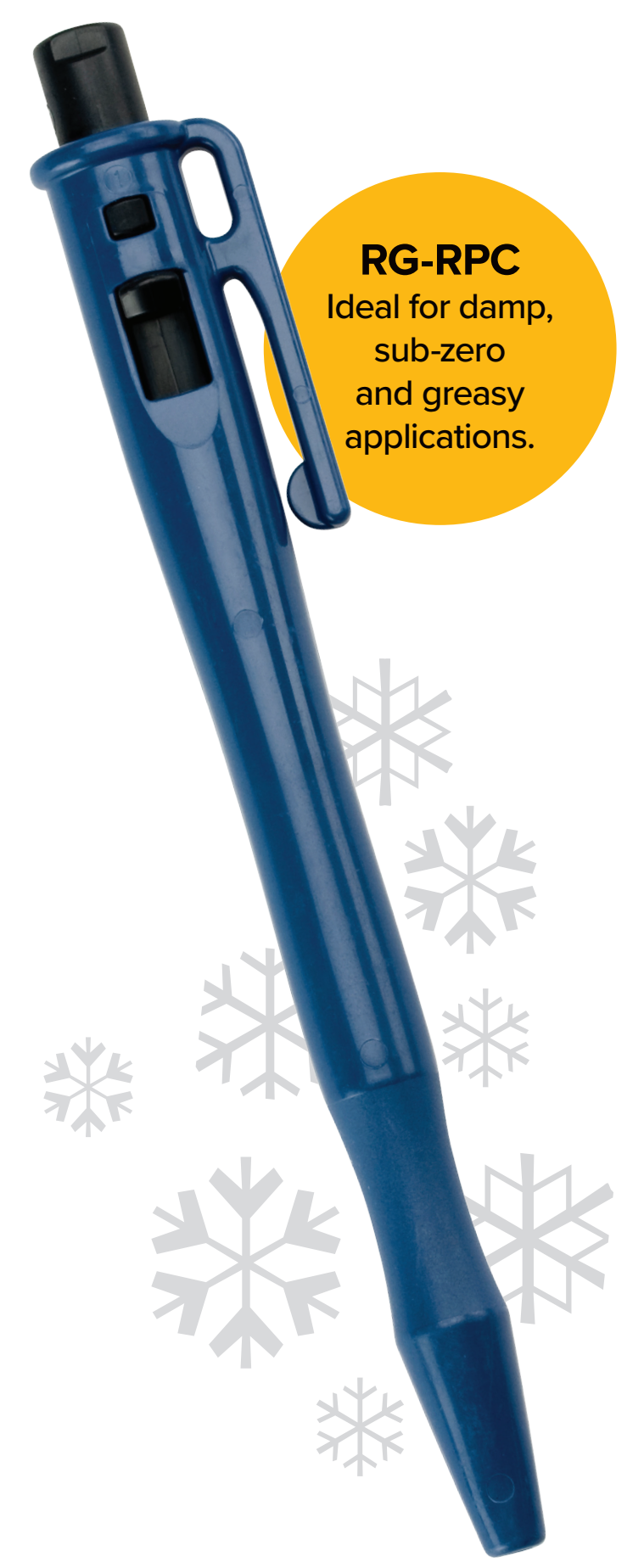
RG-RPC Ideal for damp, sub-zero and greasy applications.