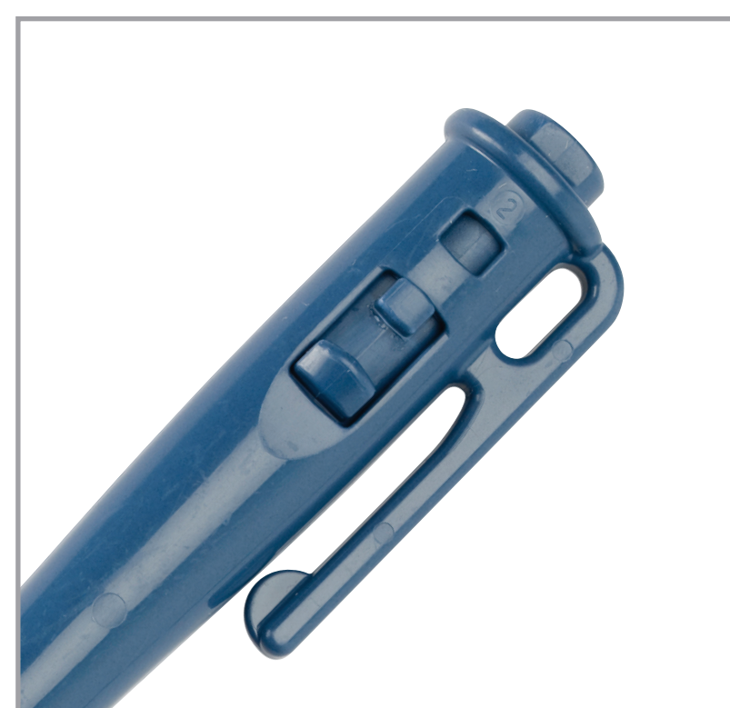
Large lanyard loop and strong pocket clip.