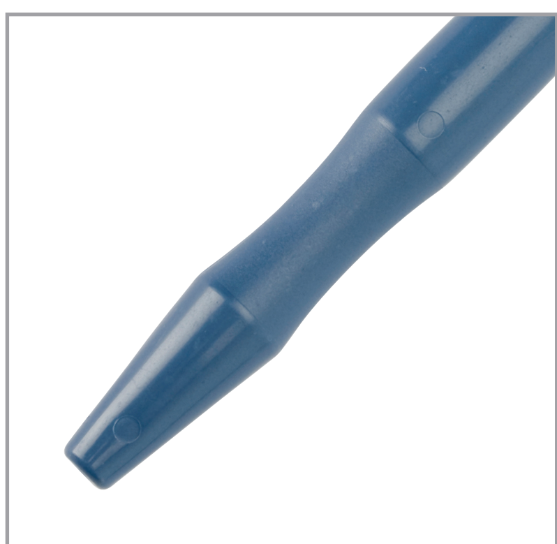
Ergo design for maximum user comfort and control.