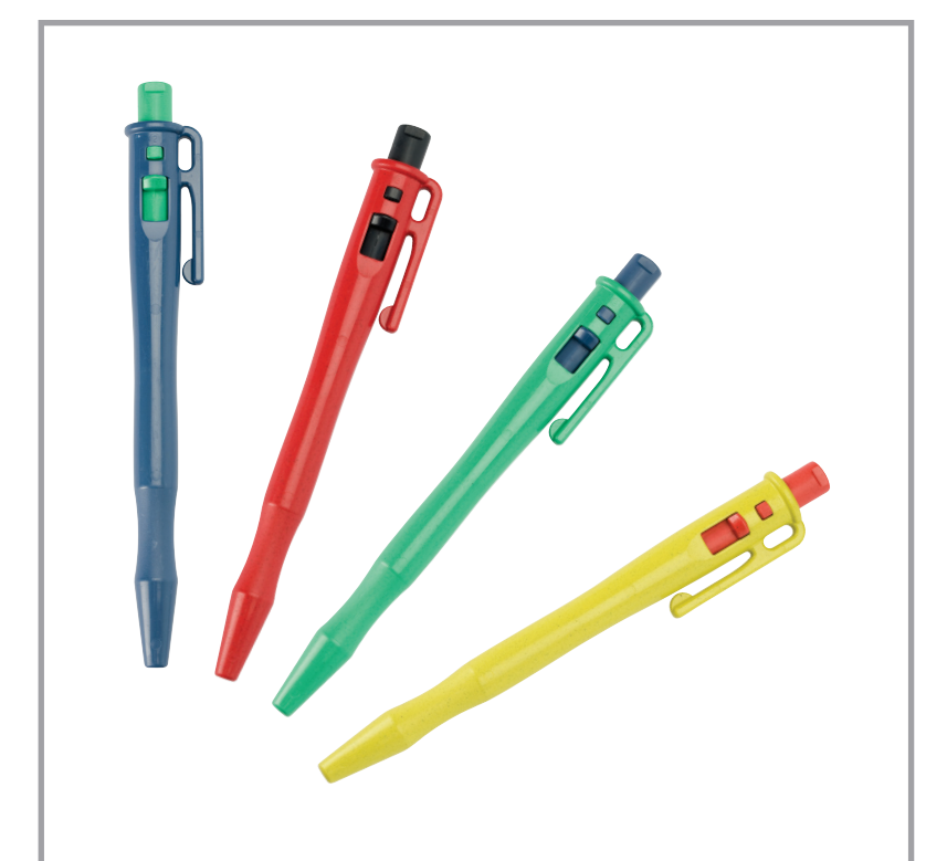
Different coloured housings. ● ● ● ●