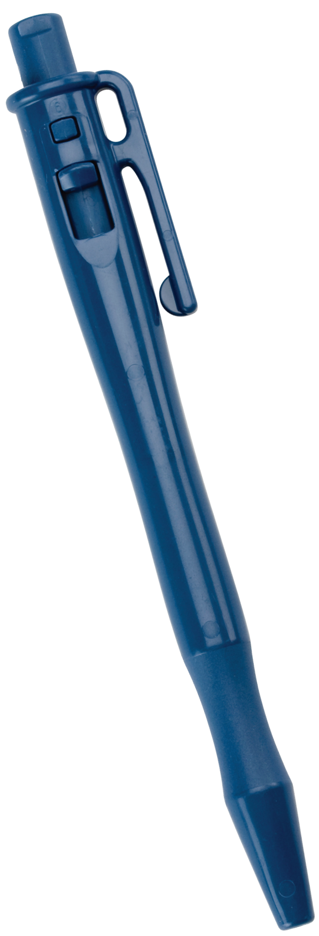
Retractable pen Loop and pocket clip Code: RG-RSC Ink colours: ● ● ● ●

THE ULTIMATE DETECTABLE WRITING EXPERIENCE.