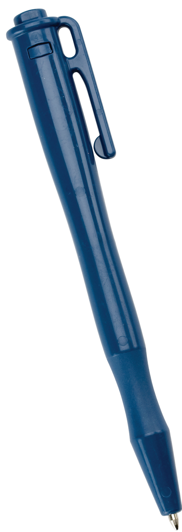
Non-retractable pen Loop and pocket clip Code: RG-NSC Ink colours: ● ●