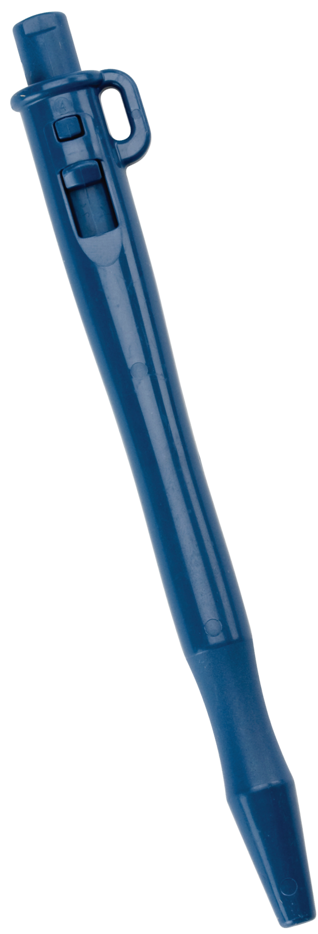
Retractable pen Loop only Code: RG-RSL Ink colours: ● ● ● ●