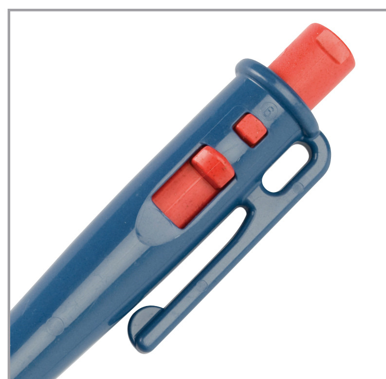
Highly visible cap and window.